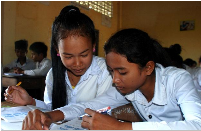
Education for Women and Girls