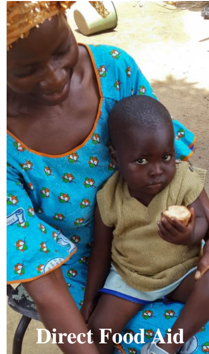
Direct Food Aid

Check-In: 8:15 a.m. Walk Start: 9:00 a.m.